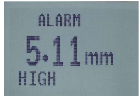
High / low alarm